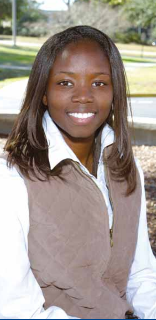
Graduation Cover